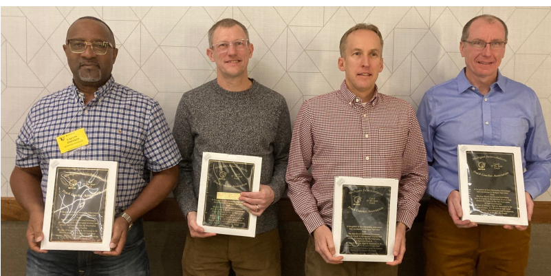
2022 Women's Coach of the Year right to left: