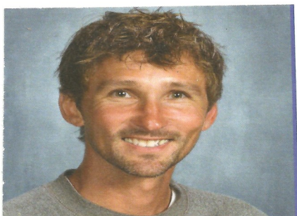
Jay Puffpaff Boys Cross Country St. Louis

The following MITCA coaches were recognized on November 13, 2022 and are eligible for regional and national Coach of the Year honors.