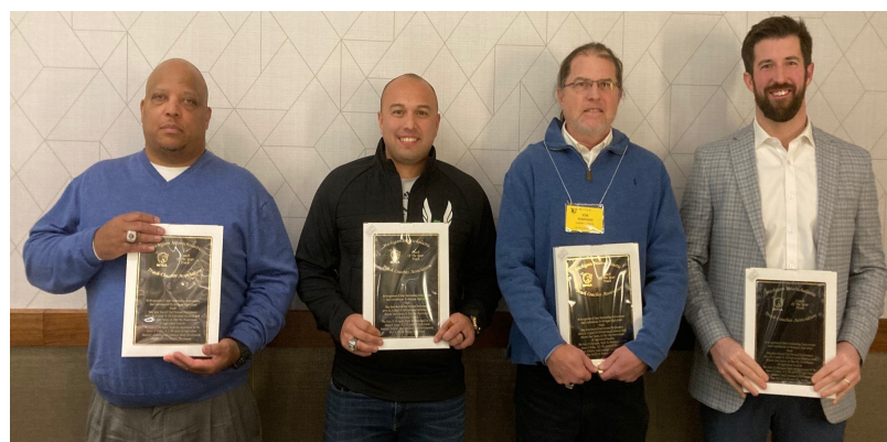
2022 Men's Coach of the Year right to left: